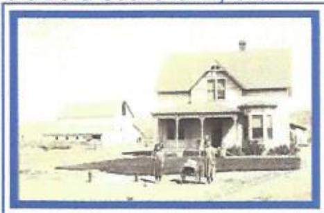
The Strathearn House in the 1890s