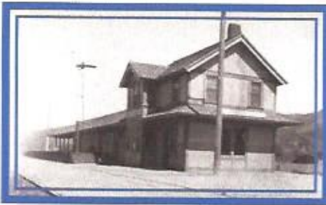
The Depot is a standard 22R design with offices on the right, freight shed on the left, and living quarters above.

NOW... Eastward to Santa Susana. It was decided that a station would be built in the east end of Simi Valley on the north side of Los Angeles Avenue, 550 feet east of Tapo Street. The station was given the name Santa Susanna (note the spelling with three 'N's) after the Santa Susana Mountains. Inexplicably, there was a sign on the west end of the depot that read 'Santa Susanna,' and a sign on the east end that read 'Santa Susana.' The station (NOT) the depot was completed in July 1900. It was called a 'station' and not a 'depot' because it was used for company business and selling passenger tickets only, not the handling of freight. Regularly scheduled passenger trains were running by July 1, 1900. The fare from Montalvo to Santa Susana was set at $1.90. The Santa Susana Station was established almost 4 years before 'The Great Tunnel' was completed through the Santa Susana mountains.