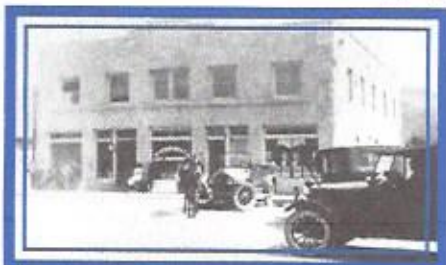
This Crinklaw building was built in 1912 across from the Depot. It was destroyed in the 1971 earthquake