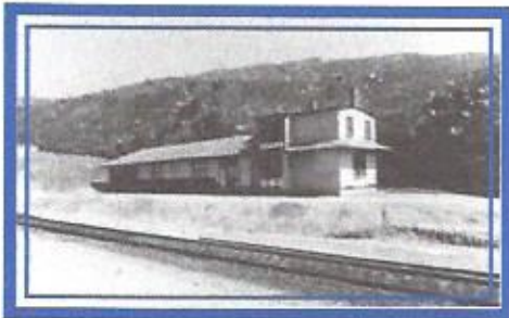
The Depot in its new location at Santa Susana Park

In May 1975 the building was divided into three parts and moved by truck two miles east of the site it was built on. The building was moved to Santa Susana Park on Katherine Road. The current location is next to the same railroad right of way it once served. The building sat abandoned for several years suffering vandalism, and sustained fire damage. A nonprofit organization, the Rancho Simi Foundation, was formed to restore the building and make it available for public use together with the Rancho Simi Recreation and Park District. A long restoration process in the 1980s and 1990s gradually restored the Depot.