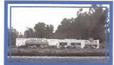
The building at 4385 Valley Fair St. built in 1924 still exists

Now... BACK to Santa Susana. An article in the July 1904 Sunset magazine article titled 'The Great Tunnel' lists the starting date for the digging of the big tunnel through the Santa Susana mountains as July 16, 1900. The first revenue train ran through it on March 20, 1904. The new route soon became a main line of the coast route. It was decided that a permanent first class station building should be built at the location of the Santa Susana station. This building included living quarters on the second story over the station agent's office space. A large freight handling room on the east end of this structure this made it a true depot rather than a station. This building was completed in March 1903. The Santa Susana Depot served passengers and farmers in the Simi Valley for more than 60 years. The depot became a center for activity because of the convenience of shipping, receiving, passenger service, mail, and access to Western Union.