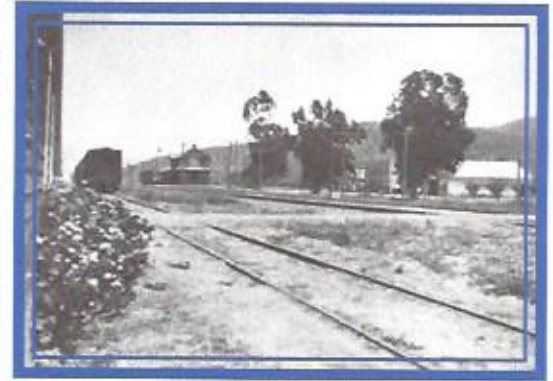
The Depot in its original location at 4495 Los Angeles Ave.

FIRST... A little background on the railroad. In the mid-1890s, the Southern Pacific Railroad had already decided that the Coastline Route should come through Simi Valley. By early 1900 the Southern Pacific Railroad entered Simi Valley over Robert P. Strathearn's property in Simi. The Strathearn siding was where the Madera Road overpass is currently located. Next, just east of First Street the tiny Simi Station was built. It was very small, only enclosed on three sides. In 1916 a more complete station was built after the public voiced their dissatisfaction with the tiny station.